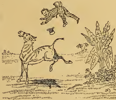
"TAMING A JACKASS."

Extreme surprise rendered the animal perfectly docile, and he walked off quietly with me upon him. I had heard travellers tell of the treachery of Wild Jackasses, and had often noticed that the infallible process to tame them was to bite their long and tender ears. So I gently leaned forward, and, encouraging the animal with my voice, I seized his right ear in my teeth, and bit it until the blood ran. It was but the